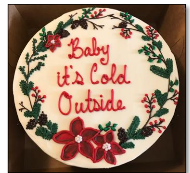
Holiday Wreath Cake